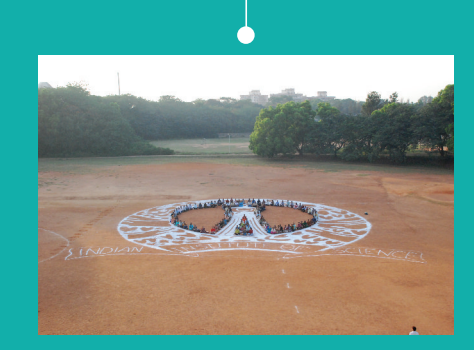
On 16 November 2008, the students, staff and faculty created a human formation of the IISc emblem.