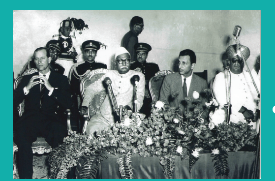
Prince Philip, Rajendra Prasad, JRD Tata and the Governor of Myso

The former President, Rajendra Prasad, wished the Institute a brighter future not only in the interest of science but also for the prosperity and happiness of the nation and world at large.