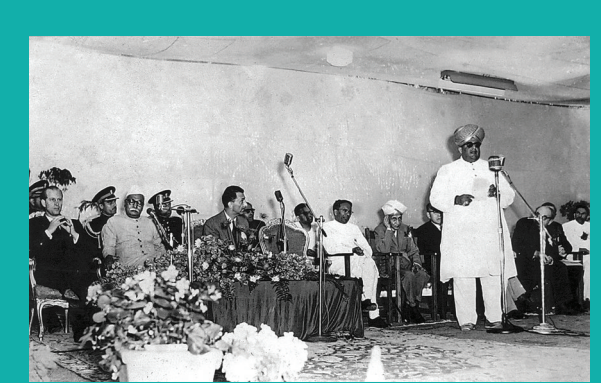
e Governor of Mysore addressing the gathering

The former President, Rajendra Prasad, wished the Institute a brighter future not only in the interest of science but also for the prosperity and happiness of the nation and world at large.