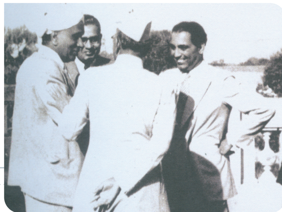
CV Raman with Homi Bhabha and others