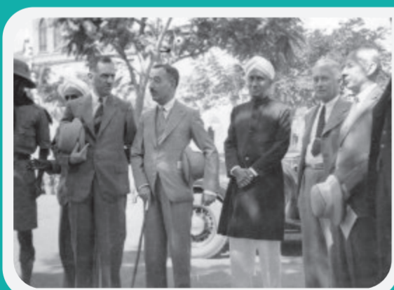
Sir Mirza Ismail (second from left), CV Raman and Max Born

In 1935, Raman invited Max Born to be at the Institute as a Reader in Theoretical Physics for a period of six months. Born was a renowned physicist who had laid the foundations of quantum mechanics, and he later received the Nobel Prize in 1954.