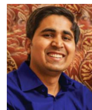
Other members of the team