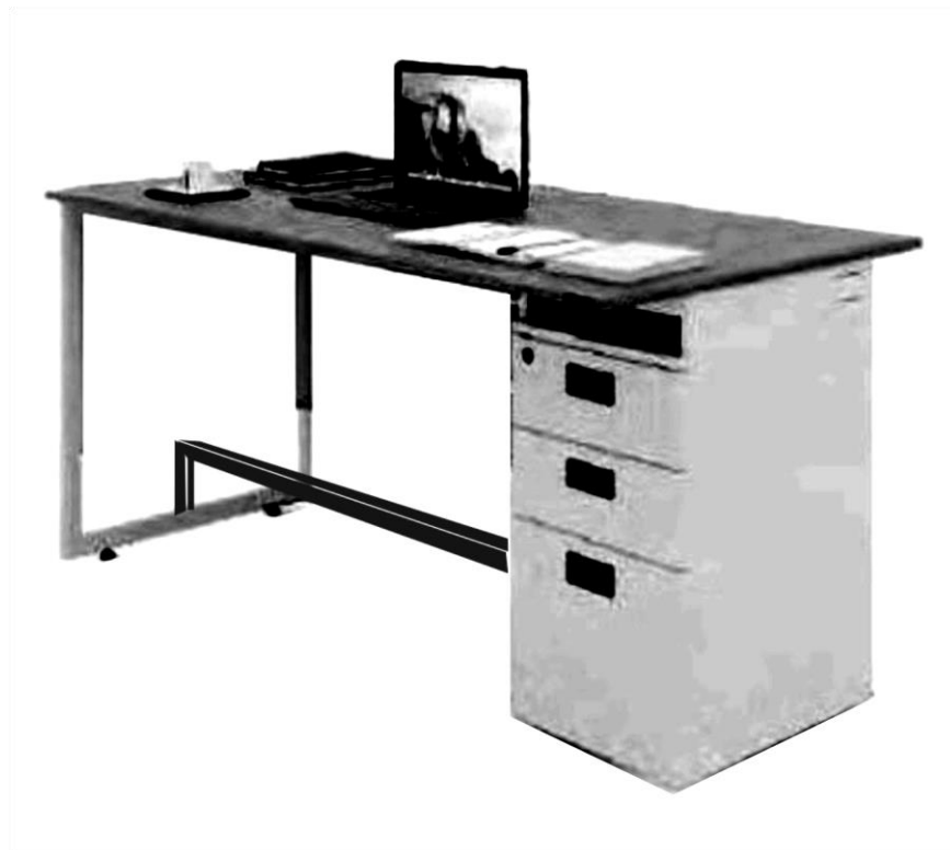
Schematic image: This image is only for indicative purposes.