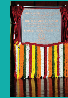
Manmohan Singh, who was Prime Minister of India at the time, unveiled the centenary commemorative stone.

The year-long celebrations came to an end in May 2009. Pratibha Patil, then India's President, re-dedicated the Institute to the nation.