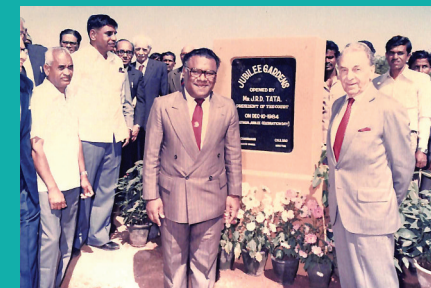
JRD Tata and CNR Rao at the inauguration of the 14-acre Jubilee Gardens.