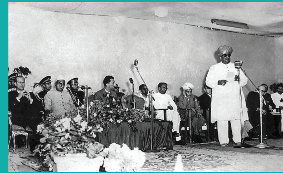
The Governor of Mysore addressing the gathering.

On the next day, he inaugurated IISc's new wind tunnel. (Germany and France were the only other countries with wind tunnels at the time.)