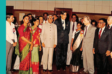
Former Vice-President R Venkataraman was invited as the chief guest. CNR Rao, who was the Director at the time, and JRD Tata are also seen in the photograph.

In his inaugural speech, Venkataraman said, "The Indian Institute of Science has always been a shining beacon for those seeking knowledge in science and engineering in the country. Initially, it was the only beacon. In Independent India, there are more such beacons; but the beacon of the Indian Institute of Science continues to shine undiminished, inspiring and encouraging hundreds of brilliant minds set firmly on the road to scientific knowledge and wisdom."