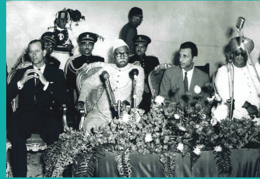
Former President Rajendra Prasad, JRD Tata and the Governor of Mysore, Moharaja Jagachamarajendra Wodeyar (L-R) at the celebrations.

The former President, Rajendra Prasad, wished the Institute a brighter future not only in the interest of science but also for the prosperity and happiness of the nation and world at large.