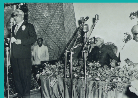
S Bhagavantam and the former Prime Minister Jawaharlal Nehru at the gathering.

Deccan Herald reported: "Nehru, in his address, observed that efforts should be made to make science a unifying force in India. He suggested that Institutes like IISc should take the initiative in disseminating scientific knowledge to various research institutes, laboratories and universities."